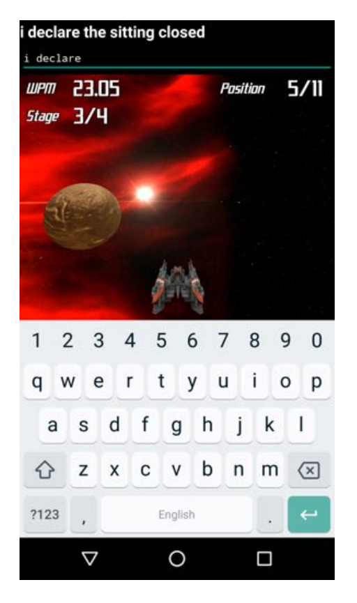
Figure 2: Screenshot of Hyper Typer gameplay