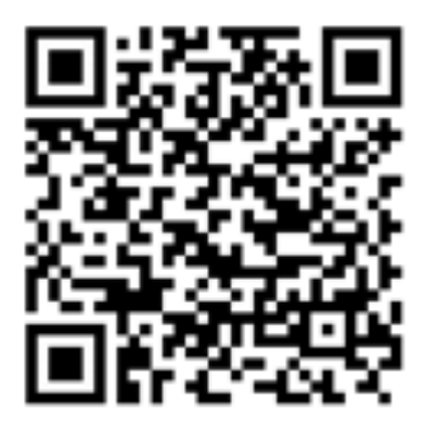
Figure 4: QRCode link to Hyper Typer on the Google Play Store [16]

Following the successful pilot test, Hyper Typer was released publicly on July 13th, 2018. Between its release and October 1st, 2018, 893 games were played on 275 distinct installations. Of those 275 installations, only 47 reached a final score higher than 0 points in 504 games. 6 games were interrupted and later resumed and therefore excluded from the results. To remove garbage input, transcribed phrases with an individual score of 0 were also filtered out. This results in a total of 1,917 usable transcribed phrases with 58,829 keyboard input events (Table 1).