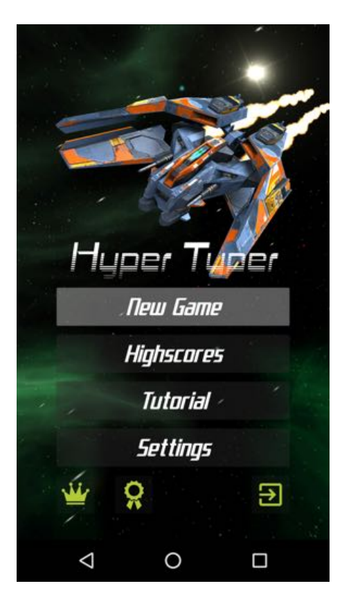
Figure 1: Screenshot of Hyper Typer main menu